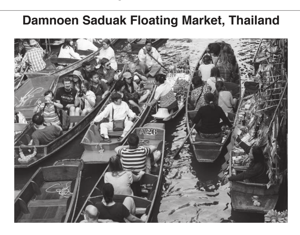
Fig. 3 for Question 4